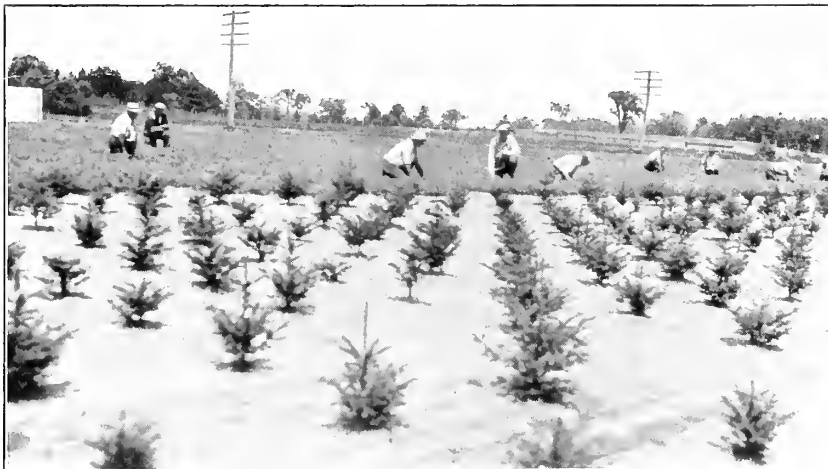
Men Weeding Four-Year-Old Trees at Nursery No. 2

ADAPTATION TO VARIOUS CLIMATES Our trees have been successfully sent to all parts of the United States and to several foreign countries, where they adapted themselves very well. Soil conditions apparently have as much to do with the adaptability of most species as the geographic locations. (See soil requirements.)